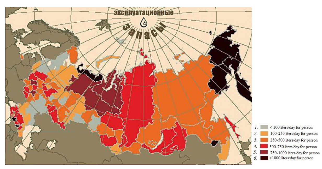
Figure 1. Provision of population of Russia with reserves of potable groundwater from deposits of the distributed and partly non-distributed fund, liters/day for one person

The current mechanism for managing the extraction of groundwater resources in Russia is complex and imperfect. There is no clear delineation of roles, rights and responsibilities of organizations associated with the management of the extraction of groundwater, as well as the division of competences among them; development